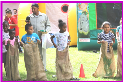
Get ready! Get set! Go!! Potato sack races on Family Fun Day.

And the winner is....Not only was it her birthday, she guessed the amount of candy in the jar and took it home as her prize. Not much of a candy-eater herself, she shared the goodies with her brothers.