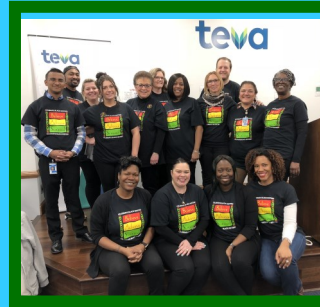
Teva staff members share their giving spirit with the Elizabeth Coalition

Generosity is giving more than you can, and pride is taking less than you need ~ Khalil Gibran